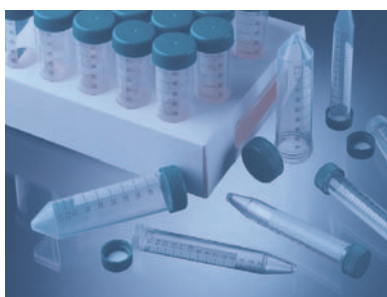
15 and 50mL tubes

Sterile 15 and 50mL screw cap tubes fit all popular centrifuges. They can all be easily labelled with standard marker pens in the frosted or printed marking area. As only a ¼ turn of the cap is needed to safely and securely close and seal, one-handed operation is straightforward. All tubes are available in both loose, bagged configuration as well as in handy recyclable card racks.